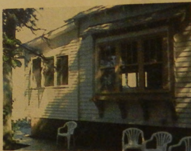
Built in 1933 by Gray Vogelsang. Owned by Gretchen and Dick Zoerner