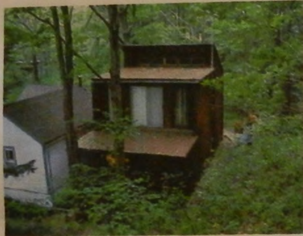
Built by Buzz Loughlin 1974