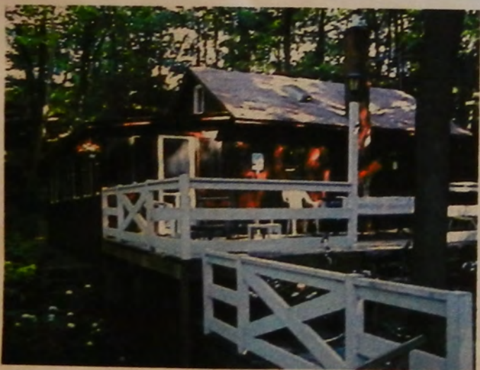
Built by Irving Vogelsang 1934? Sold in 1970?